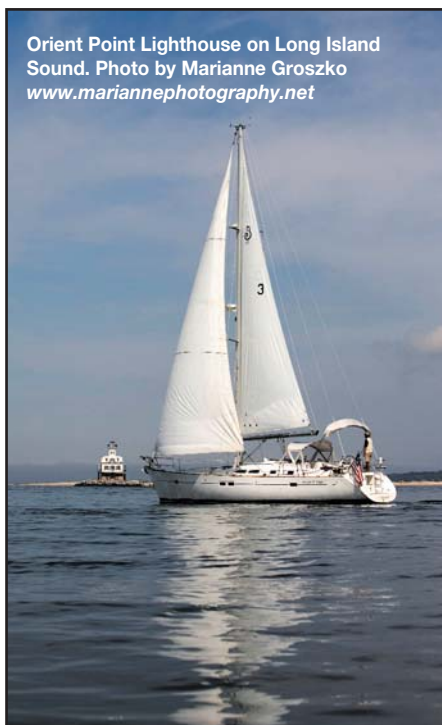
Orient Point Lighthouse on Long Island Sound.

For more information, call (800) 661-4013, or click to www.bareboatnewport.com or www.bareboatcharters.com .